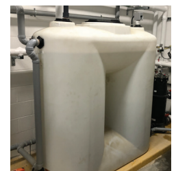
DAY STORAGE MODULE